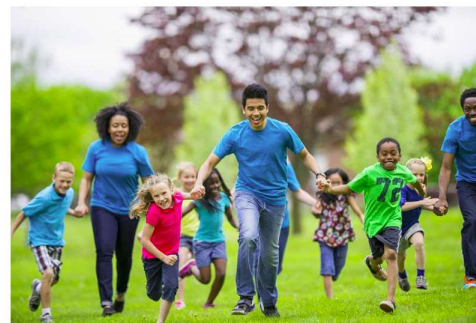
COAST - Children and young people

https://www.swansea.gov.uk/article/23502/COAST-Creating-Opportunities-Across-Swansea-Together-events