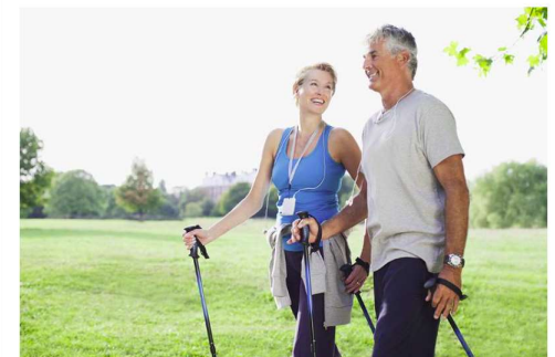
COAST - 50+

Activities available between 15 July and 30 September 2023 for children, young people and families who reside or who are supported in Swansea.